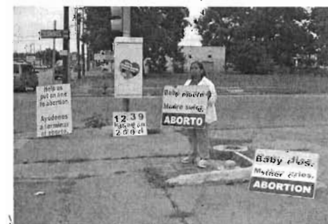
Many messages for Wacoans going to work and women headed for abortions.