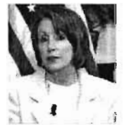
New House Speaker Nancy Pelosi (D-CA)

With control of Congress, Democrats plan to make a bill that would force taxpayers to pay for embryonic stem cell research one of the first pieces of legislation put forward next year. However, they may not have enough votes, even with the election results, to overturn a veto from the president. House Speaker Nancy Pelosi says a measure similar to the one President Bush vetoed earlier this year will be voted on during the first 100 business hours of the next congressional session that begins in January.